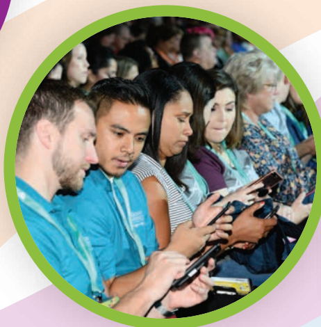
Nurses at the 2017 ANCC National Magnet Conference®

"As both a registered nurse and the CNO of a global manufacturer and distributor of medical products with person-centered solutions, services and expertise, I am proud to partner with the American Nurses Foundation to advance nursing practice and nurse-led initiatives."